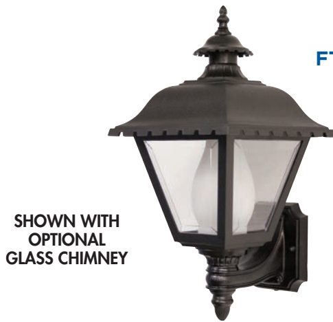
SHOWN WITH OPTIONAL GLASS CHIMNEY