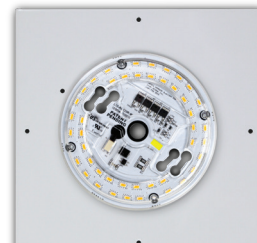
SL12-AC120R-W-M804PL 14W, 1430LM, 3000K