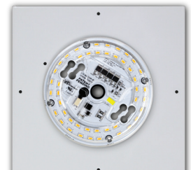
SL18-AC120R-W-M804PL 22W, 1950LM, 3000K