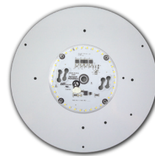
SL18-AC120R-W-M802PL 22W, 1950LM, 3000K