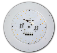
SL26-AC120R-W-M802PL* 32W, 2700LM, 3000K