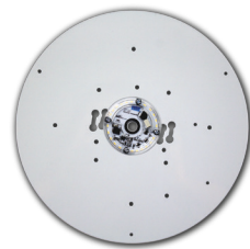
SL08-AC120R-W-M802PL 13W, 1140LM, 3000K